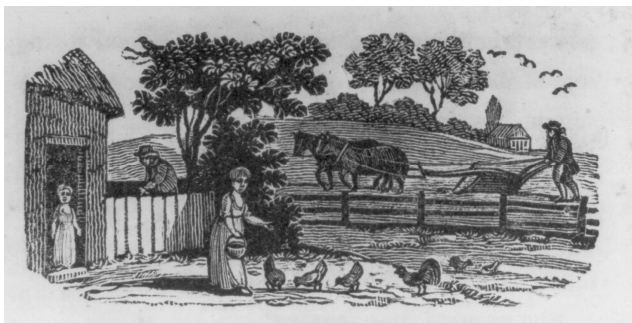
An American farmyard