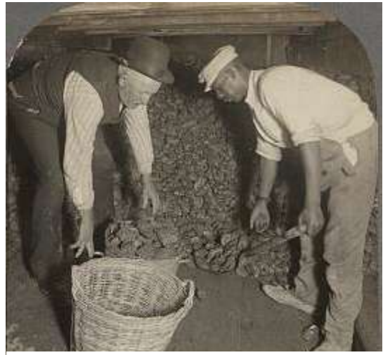
Oysters leaving the Chesapeake Bay in a ship's hold

be eaten, hides tanned for shoes, wool used for clothing, and their milk made butter and cheese. All these items could be exported to help the patriotic cause. Seafood was harvested too, as Saxis is known for today. Oysters were a cheap staple in diets. In the Colonial era, the Chesapeake Bay was clean, and oysters had not yet been overharvested. They could be preserved and shipped to the English, who had eaten oysters even before immigrating to the colonies. The famed Chesapeake blue crab was not yet a staple to their diet. At the time, fishing was done with hook and line. Most fisherman didn't fish far from shore to avoid the threat of enemy kidnapping.