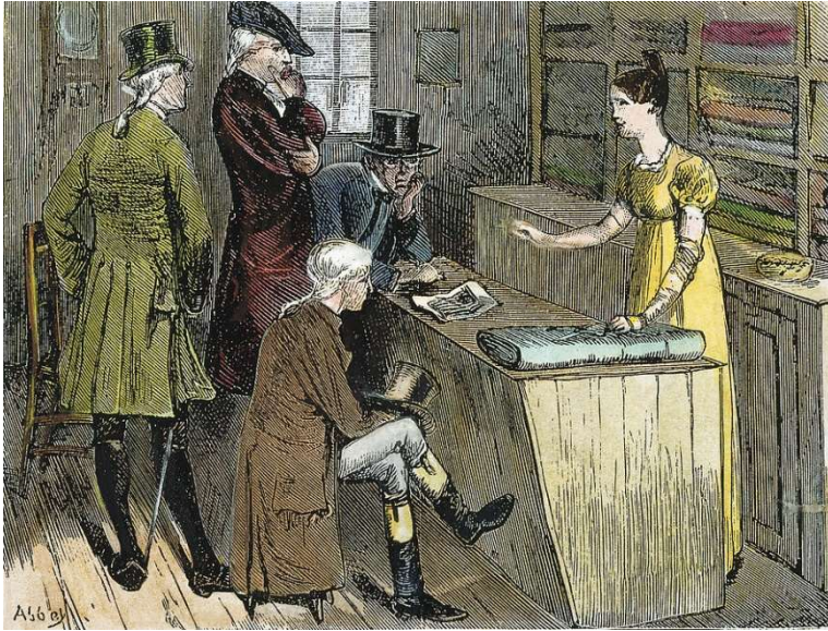
Depiction of men shopping in a dry goods store

manufacture such items to get them here. However, village stores like the one you see now were not typical in rural Virginia during the Colonial era. Trade often took place in the county square on court days when the proceedings being held would be sure to bring a congregation of people into town. Other traders set up at high traffic areas near the wharves. Otherwise, they were