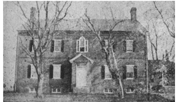
Corbin Hall overlooking Chincoteague Bay