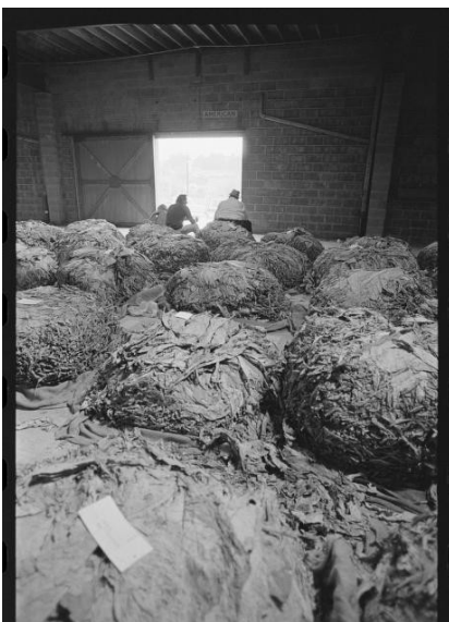
Hogsheads of tobacco